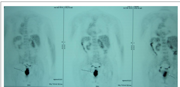
Figure 2: Whole body ( ^{18}\text{F} )-florodeoxyglucose (FDG)-PET-CT showing the presence of a mass, spanning a 5.5 cm segment of the rectum associated with rectal wall thickening.

Locally advanced rectal cancer cannot be resected without a high probability of leaving microscopic or gross residual disease at the original tumor site due to tumor fixation or adherence to neighboring tissue [9]. Hence, standard treatment in the case of most patients with locally